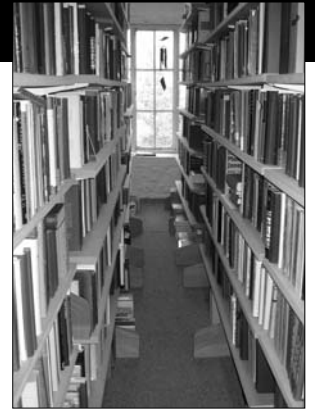
View of book rooms, Fromehall Mill

The book rooms are located in a converted woolmill on the river Frome in the old mill town of Stroud, Gloucestershire, in the southern Cotswolds. Stroud is in a picturesque location at the meeting of five valleys, and can easily be reached by road from the motorways, M5 or M4, or by rail from London, the North, and the Southwest of England.